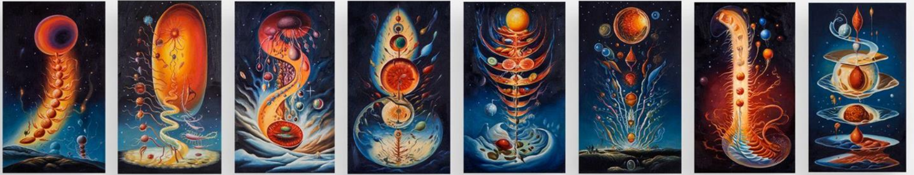
Becomings (V-XIII) , 2023 Series shot 9.8 x 56.6 inches