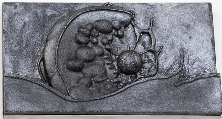
Landscapes within me, a billion years away (I, II), 2023 Cast aluminum, black patina, steel, silicone 9 x 14 inches