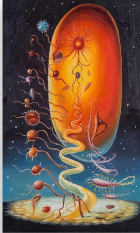
Becomings (V-XIII) , 2023 Acrylic and varnish on canvas 9.8 x 6.2 inches