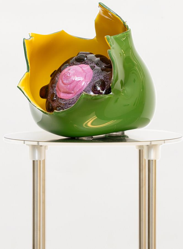
Yearning Panspermia , 2023 Blown Glass 11 x 11 x 11 inches