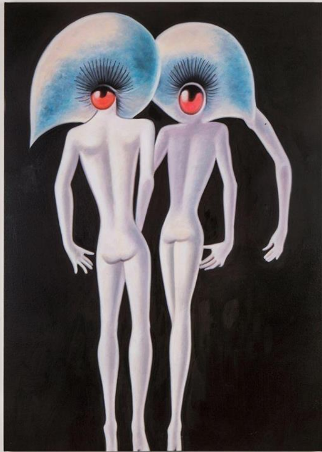
Shythems (Xenobody Erotica) , 2023 Acrylic on canvas 41.7 x 29.5 inches