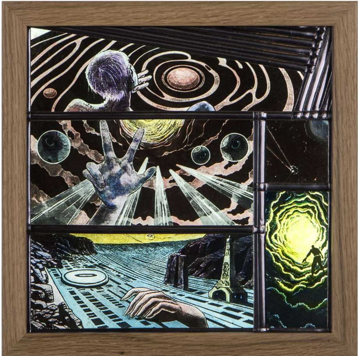
Tales of Different Desires, Conjuring Xenonarratives (B2, P1) Cuentos de Deseos Alternos, Conjurando Xenonarrativas (B2, P1)

Composite Vitraux; Stained glass and fused glass, framed with LED backlight 23.5 x 23.5 cm