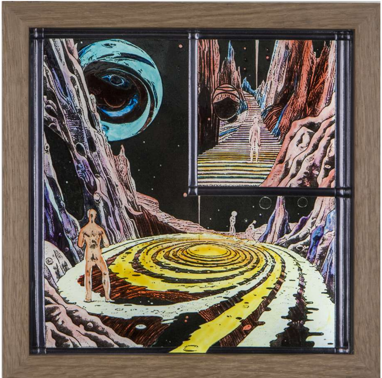
Tales of Different Desires, Conjuring Xenonarratives (B2, P2) Cuentos de Deseos Alternos, Conjurando Xenonarrativas (B2, P2)

Composite Vitraux; Stained glass and fused glass, framed with LED backlight 23.5 x 23.5 cm