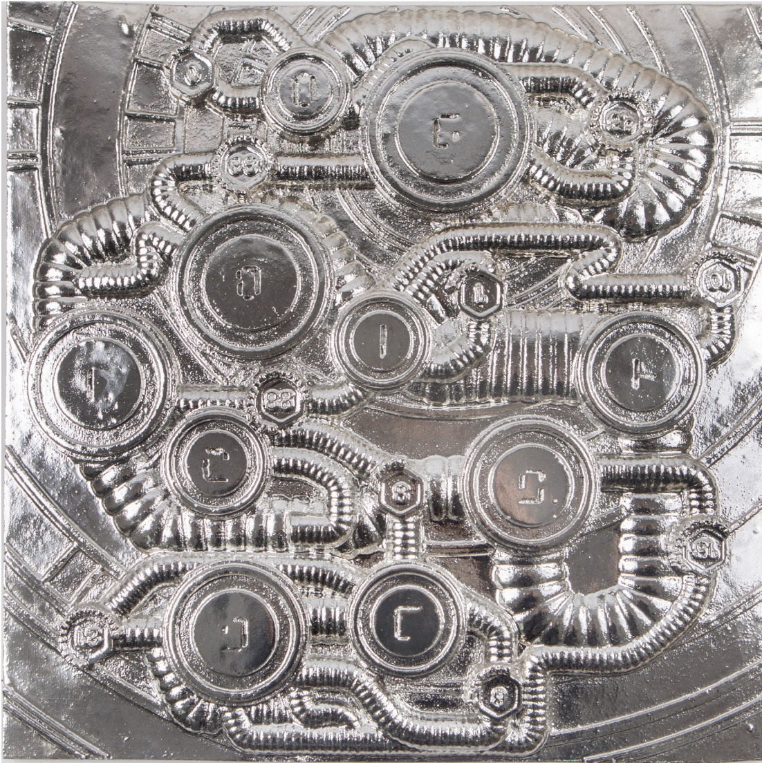
Matriz de potenciales Laberinto base 10 decimal

Resina, revestimiento de cromo, marco, hoja de aluminio 50 x 50 cm 20 x 20 in