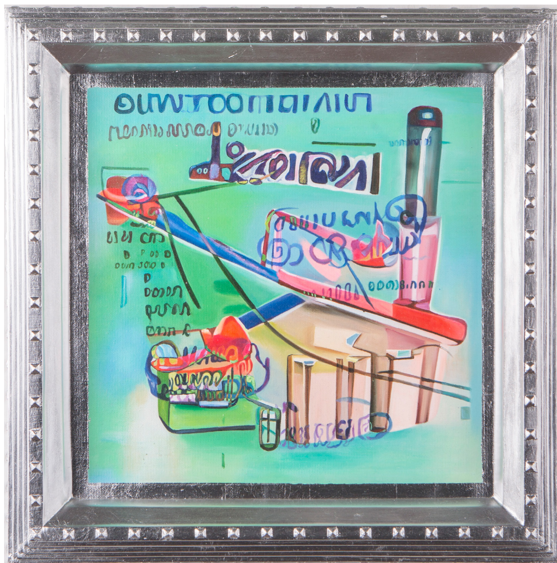
Diagrama para la producción de sujetos y significados Serie Metadiagramas

Óleo sobre lienzo, marco metálico, hoja de aluminio 48 x 48 cm 19 x 19 in